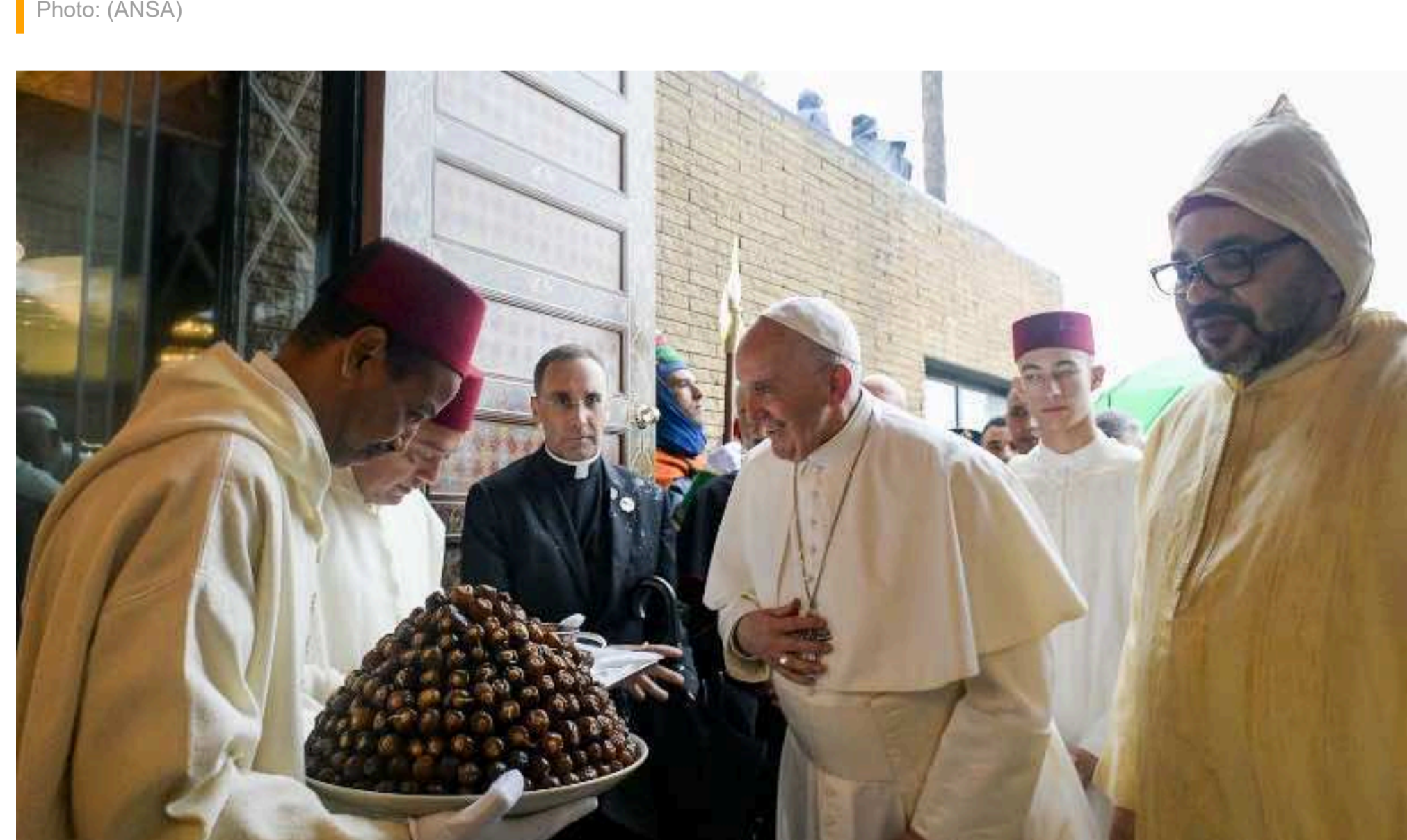
Pope Francis welcomed with dates and molasses. Lifestyle articles

The Pope is also expected to meet with Morocco's Christian community, including the congregation of Morocco-based bishops. He will end his visit with a papal Mass on Sunday.