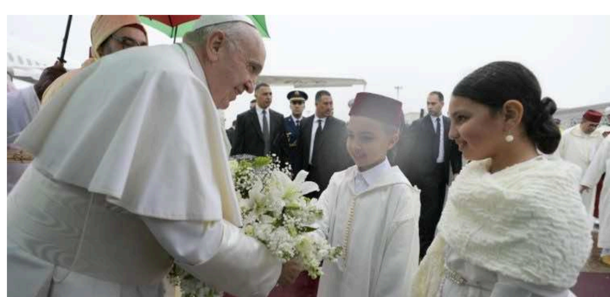
Children welcome Pope Francis in Morocco, March 30, 2019.

The Pope will visit the Mausoleum of King Mohammed V, the Mohammed VI Institute for the Training of Imams to meet with Islamic scholars and students, and head to the Caritas migrant center, where he will meet with a group of sub-Saharan migrants with whom he will share messages of hope and peace.