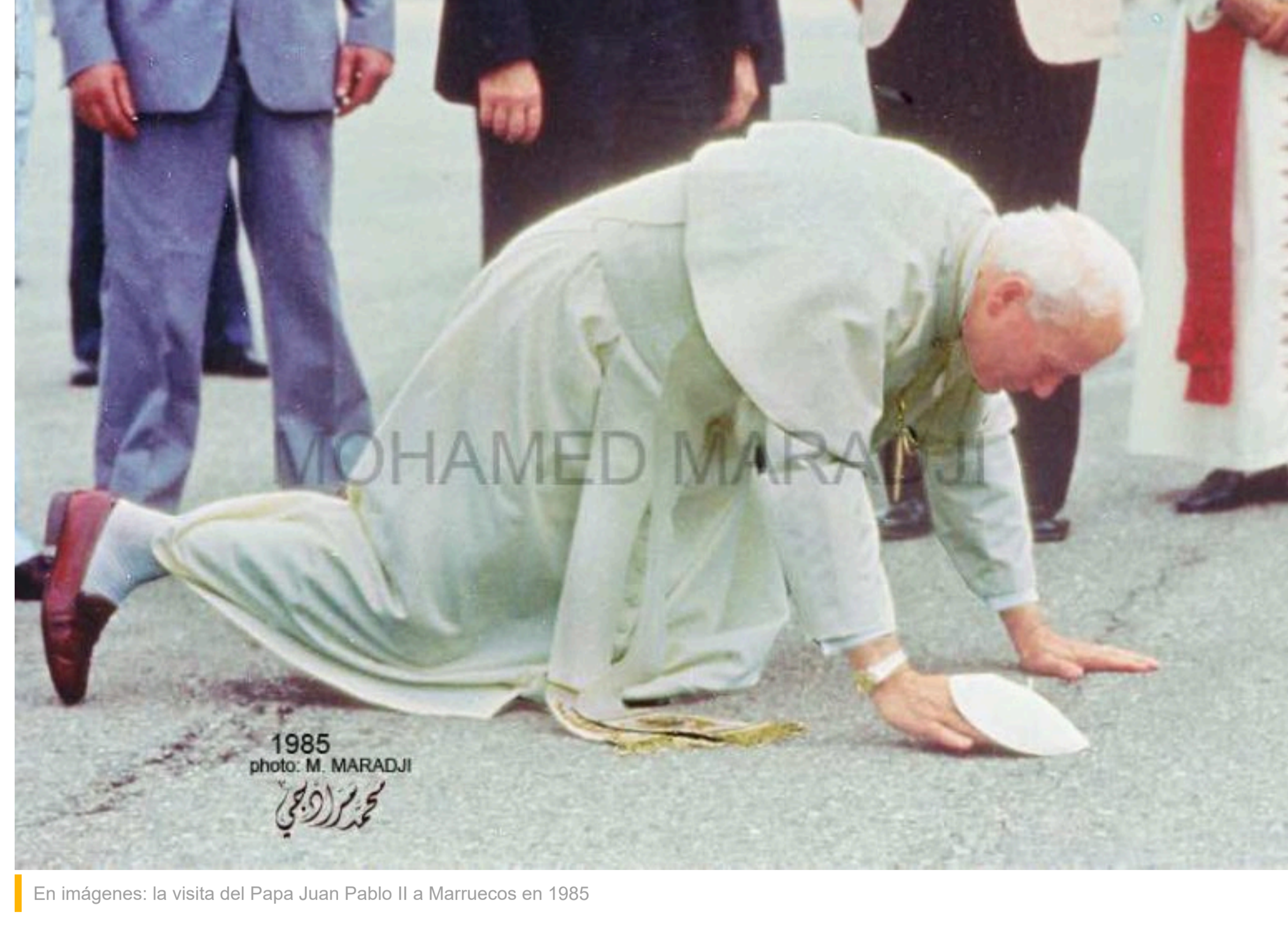
En imágenes: la visita del Papa Juan Pablo II a Marruecos en 1985

Rabat – Como la llegada del Papa Francisco a Rabat hoy marca la segunda visita papal a Marruecos, el acontecimiento recuerda la visita de Juan Pablo II al país en 1985—es el primero en llegar a un país musulmán tras una invitación directa de su líder. Artículos de estilo de vida