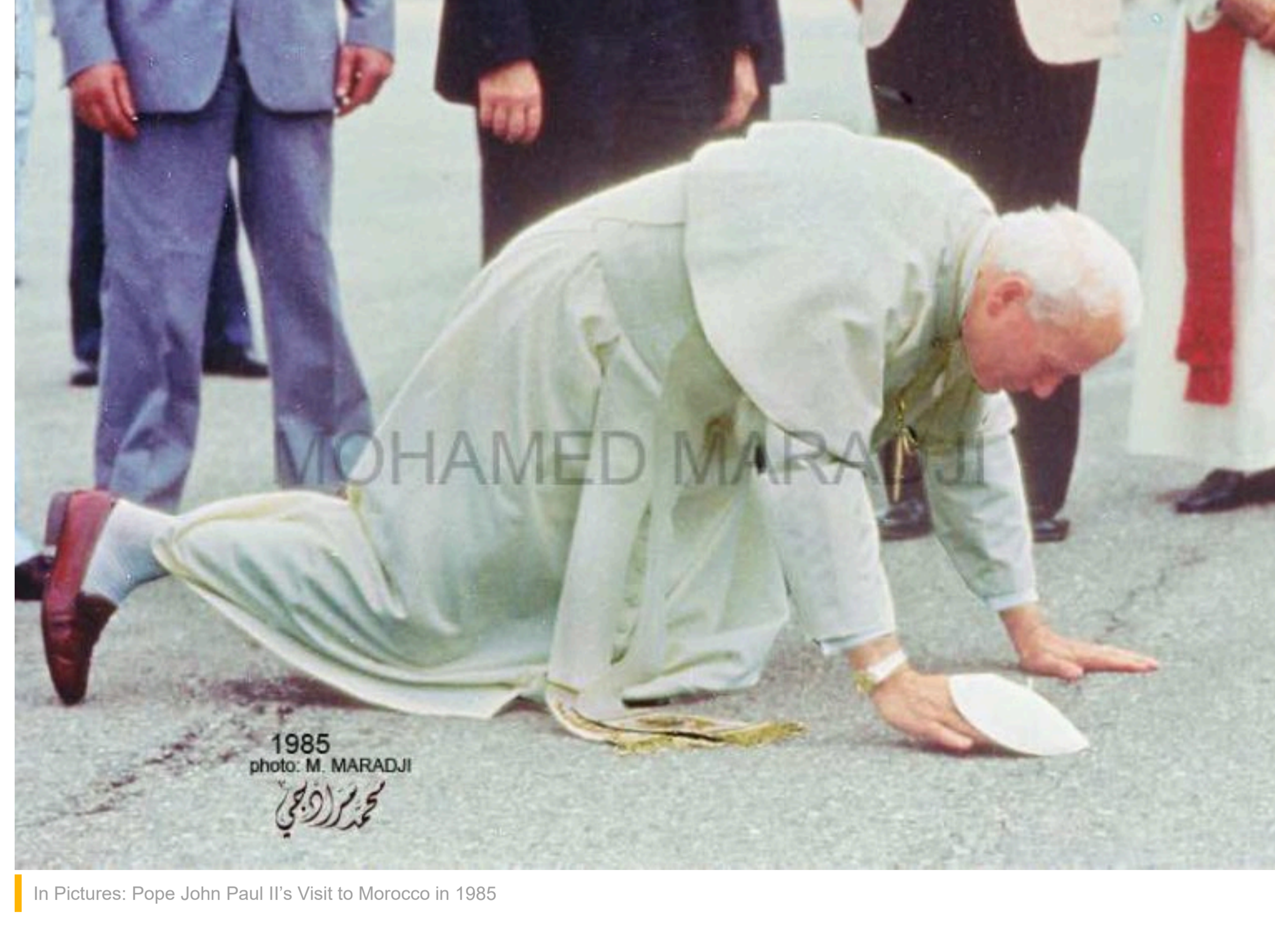
In Pictures: Pope John Paul II's Visit to Morocco in 1985