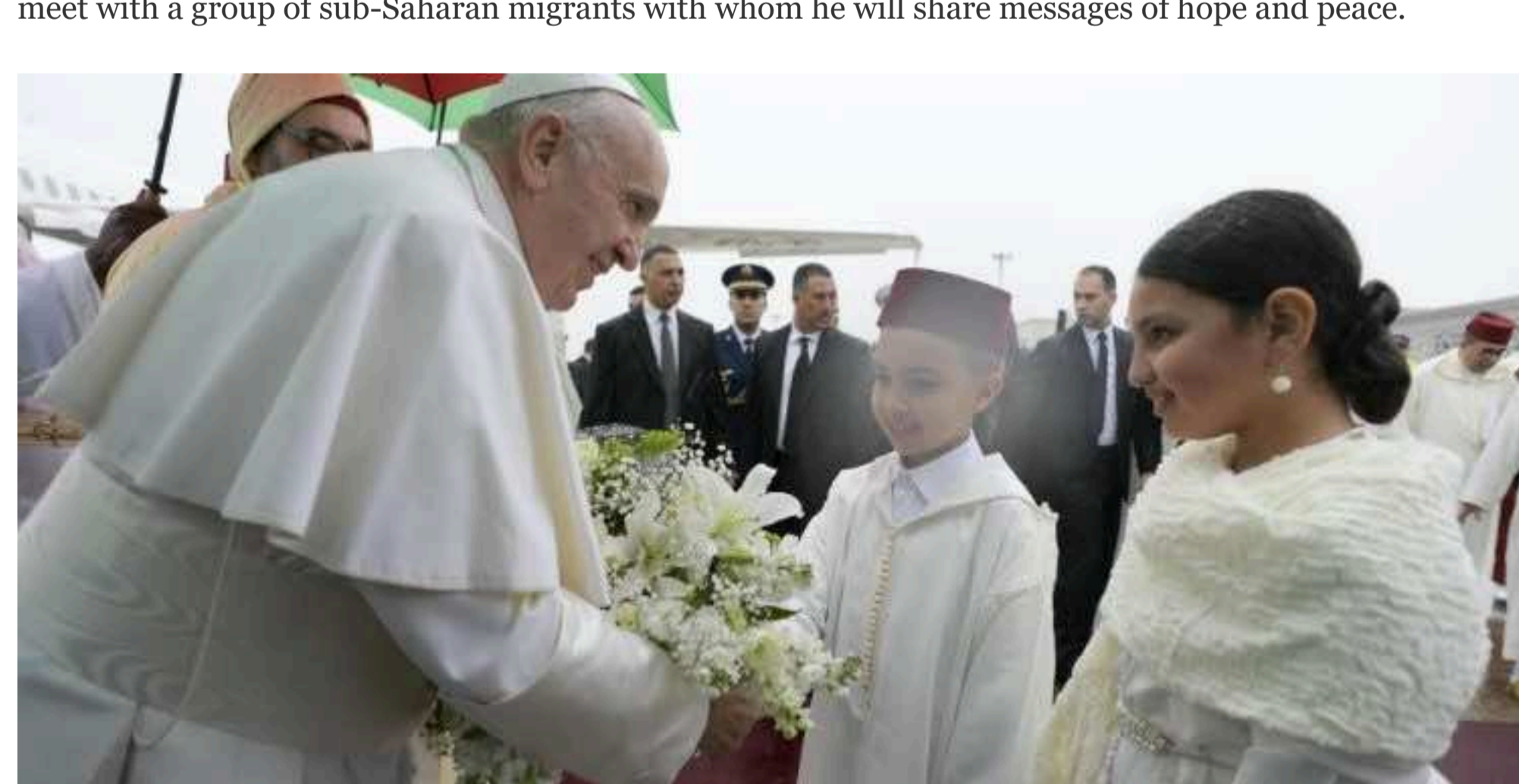
Children welcome Pope Francis in Morocco, March 30, 2019.

The Pope will visit the Mausoleum of King Mohammed V, the Mohammed VI Institute for the Training of Imams to meet with Islamic scholars and students, and head to the Caritas migrant center, where he will meet with a group of sub-Saharan migrants with whom he will share messages of hope and peace.